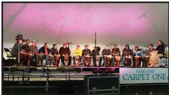
Drumming for Change