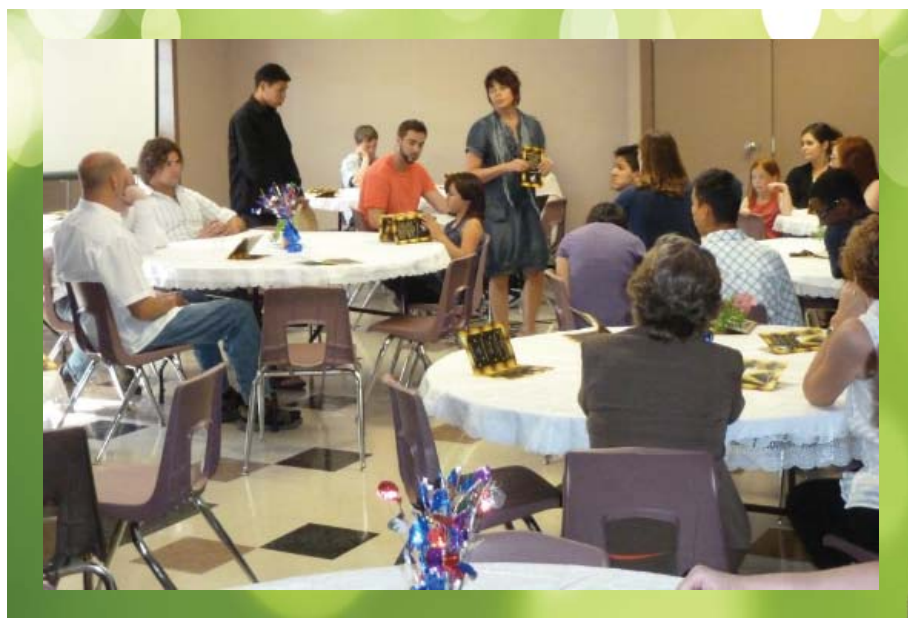
Learning Centre Awards Night

There was also entertainment from staff and youth, including skits from all the houses and a final performance of the night from the Ranch Powwow Club.